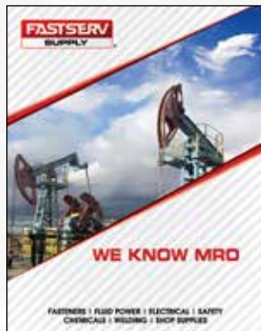
PRODUCT CATALOG 979.2100FS