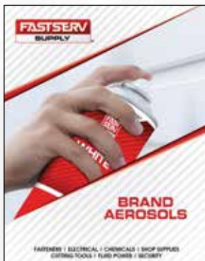
BRAND AEROSOLS 979.150FS