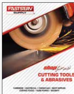
CUTTING TOOLS 979.8931FS