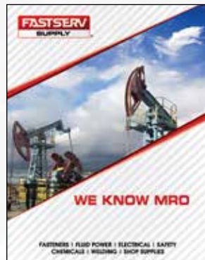
PRODUCT CATALOG 979.2100FS

WANT MORE FASTSERV? CHECK OUT OUR OTHER BROCHURES AT FASTSERVSUPPLY.COM AND FOLLOW @FASTSERVSUPPLY ON LINKEDIN AND FACEBOOK