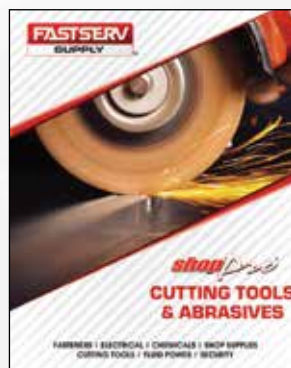
CUTTING TOOLS 979.8931FS