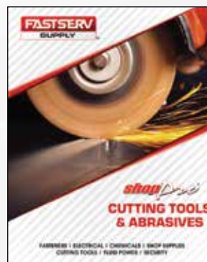
CUTTING TOOLS 979.8931FS