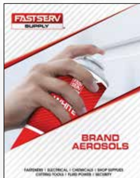
BRAND AEROSOLS 979.150FS